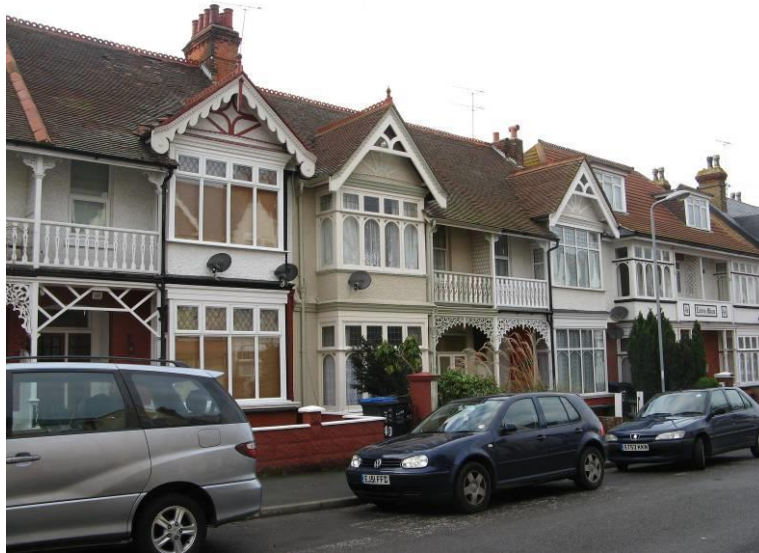
Nos. 36-42 Norfolk Road – recommended for local listing

Terraced mainly residential property dating to the early 20 th century provides the predominant building type in the Conservation Area. The buildings form groups with similar details, presumably reflecting slightly different dates of development as well as different builders. Usually, they reflect the fashion of the times with typical details of the Edwardian (rather than the Victorian) period, and they are sometimes quite decorative with attractive first floor balconies and other external joinery.