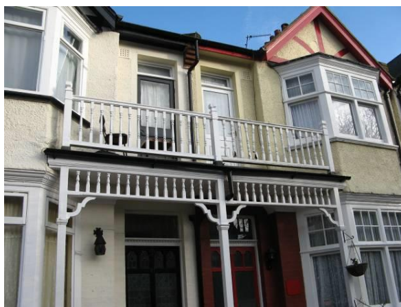
Norfolk Road east side