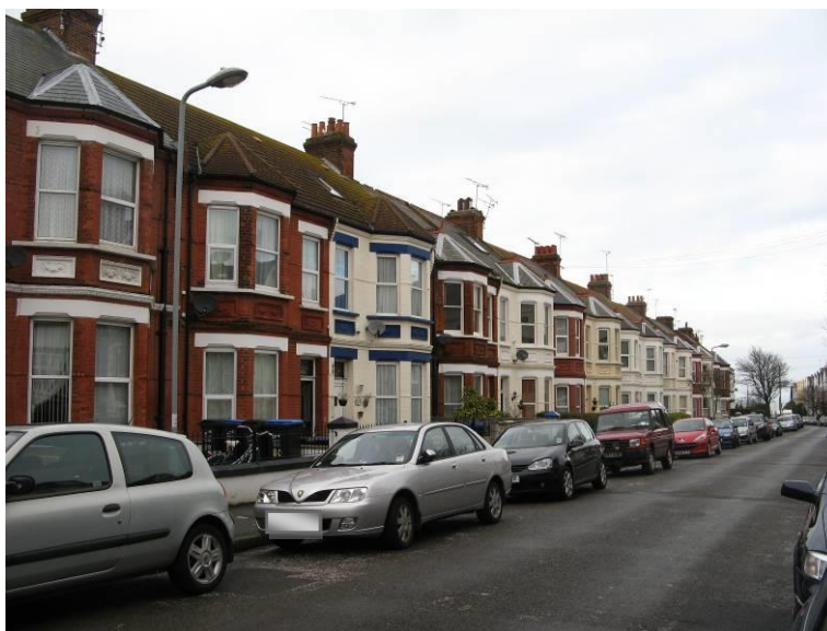
Norfolk Road – west side

Cliftonville has also been identified as important part of the local heritage by officers of the District Council, by Historic England (this Appraisal was in the main grant funded by Historic England), and by the local community, which has been consulted on initial drafts of this document.