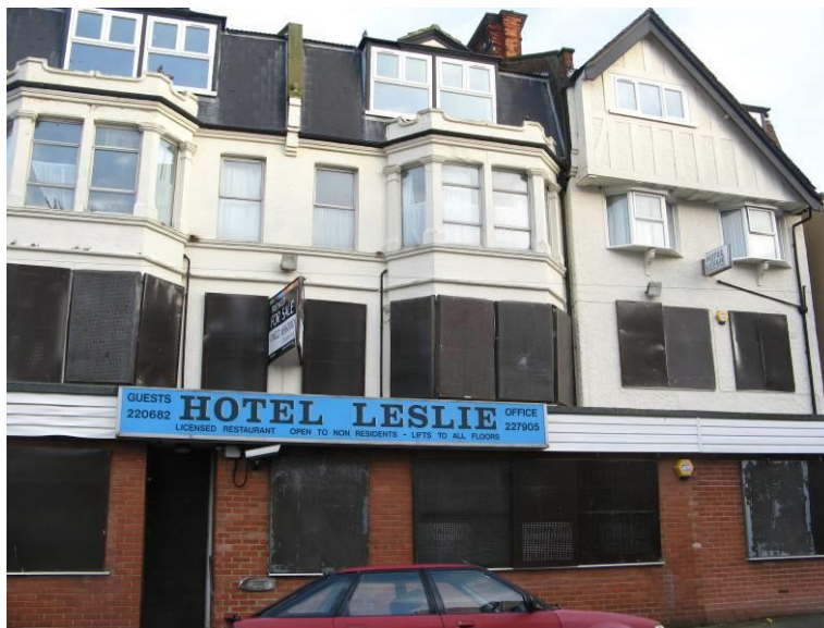
The Hotel Leslie in Surrey Road in 2010 (now demolished)

The District Council currently has a Heritage Lottery Fund funded Townscape Heritage Initiative grant scheme in the Dalby Square Conservation Area. It is possible that this scheme could be extended, or a new scheme applied for the Norfolk Road, Warwick Road and Surrey Road Conservation Area at some stage in the future. Other funding agencies, apart from the HLF, include Historic England, Thanet District Council, Kent County Council and the Homes and Communities Agency (HCA).