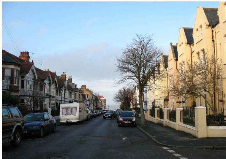
View along Norfolk Road to the sea

The Conservation Area lies within the Cliftonville West Ward of Thanet District Council. The area of Cliftonville West Ward is in the region of hectares and the population (at the 2011 census) was 7608. Demographically, the population is predominantly white European.