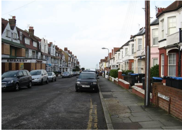
Improvements to the public realm are needed in the Conservation Area (Surrey Road)