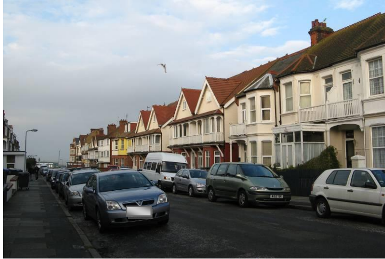
These properties in Surrey Road were mainly built in the 1920s