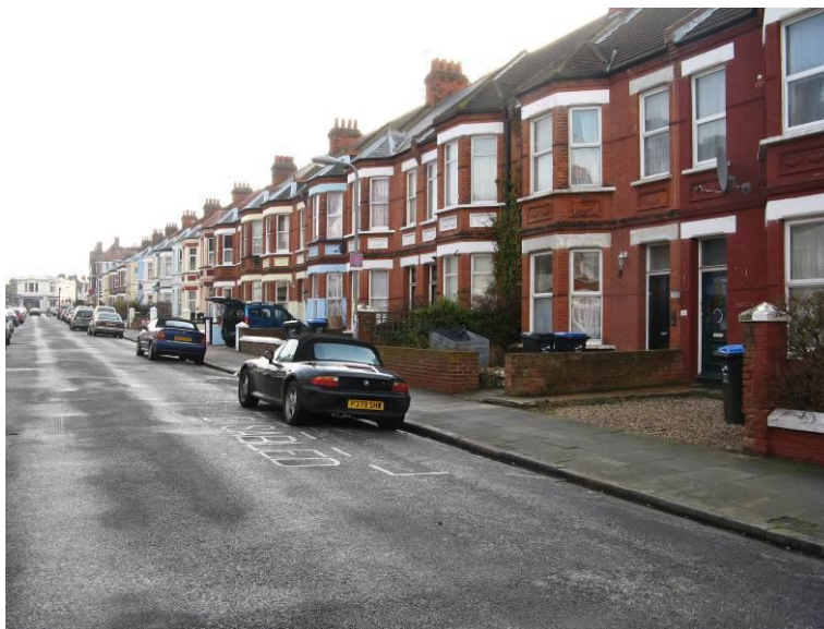
Warwick Road – west side

Road are more substantial three storey terraced properties, and it is possible that they may have been purpose built as guest houses.