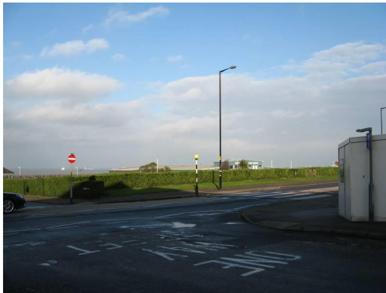
View towards the Thanet Indoor Bowls Club from the end of Surrey Road

The simple grid pattern of streets, and the cohesive mainly residential development on either side of each road, means that there are no focal points and that no one building particularly stands out.