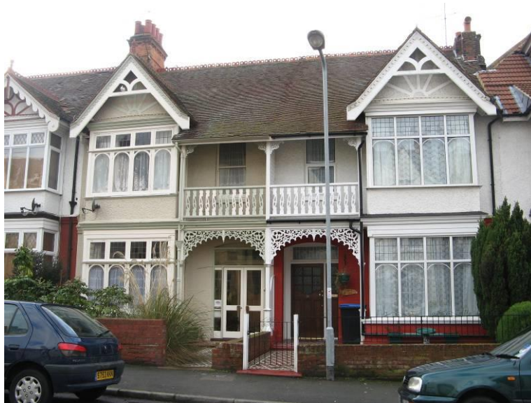
Nos. 36 and 38 Norfolk Road

There is currently no Local List for Cliftonville. With the publication of PPS5 in March 2010, locally listed buildings have become an important 'heritage asset' of particular significance where they also lie within a designated conservation area. The preparation of a Local List for the whole of Cliftonville may therefore be seen as a priority, but meanwhile, this document includes recommendations for new locally listed buildings as follows: