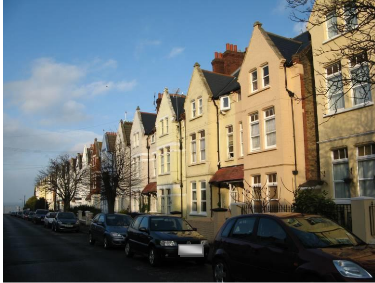
Nos. 3-49 Norfolk Road

properties (Nos. 2-16 even) are three storeys high with square two storey bays (with terracotta decorative panels) and four over one sash windows. Again the front doors have fanlights. The roofs are covered in clay tiles rather than slate.