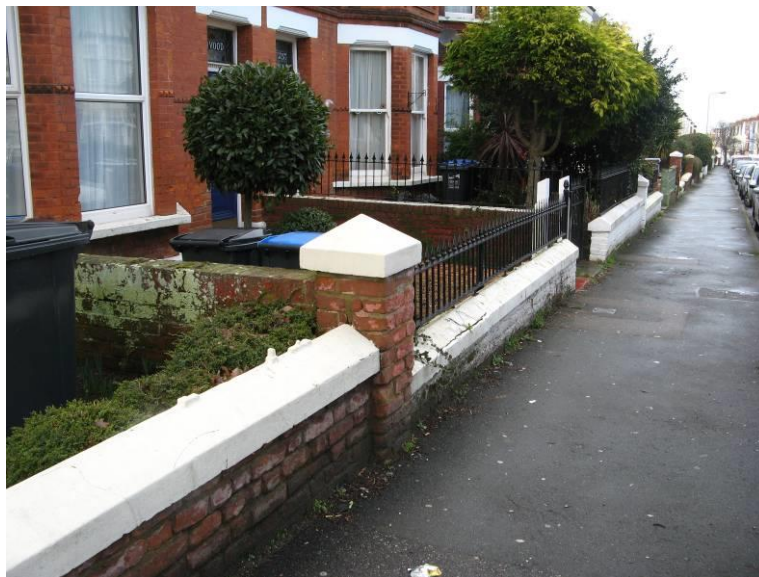
Front boundaries in Norfolk Road show evidence for earlier cast iron railings

The orientation of the buildings to the street mean that virtually every building (unless modern extensions intrude) has a small front garden, usually about three metres deep, which provide an opportunity to plant small trees and shrubs. These gardens are usually defined by low (about 600 mm high) red or brown brick boundary wall with simple triangular or rounded white painted stone copings. Boundary piers and gate piers are taller and are also topped by white stone copings. In some locations, carefully trimmed hedging can be seen behind these low walls.