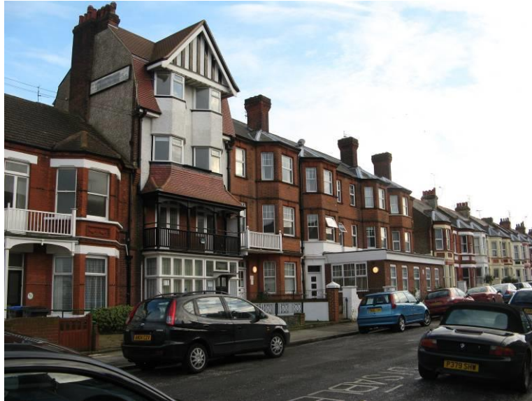
No. 15 Warwick Road on left

The buildings of Surrey Road are generally not so well detailed or well preserved as the other two streets, and also later in date. Nos. 2-24 are shown on the 1907 map but otherwise the remaining properties probably date from the 1920s (allowing for a gap of about ten years during World War I). Architecturally, Nos. 2-24 are the most interesting – they are substantial three storey high buildings which may have been built as guest houses as they were closer to the beach. They have first floor balconies which would have provided views down to the promenades and are built from red brick with first floor balconies. The windows were mainly sashed but very few original examples remain today. The roofs face the front and have three light dormers with rounded pediments – clearly original. Further north, but on the same side of the road, Nos. 30-46 date to the 1920s and have been much altered.