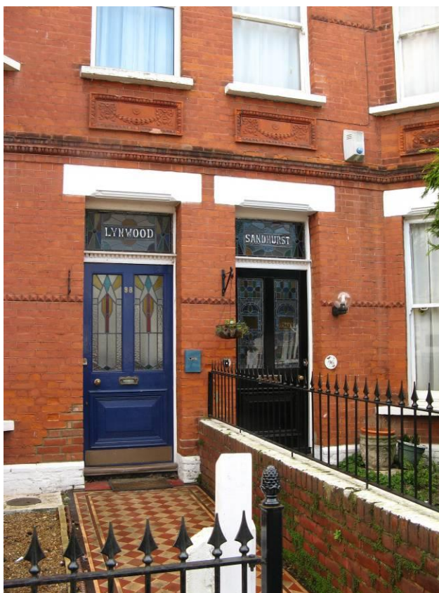
Front door details – Norfolk Road west side

Norfolk Road, Warwick Road and Surrey Road form part of the distinctive grid pattern of streets which were developed in the late 19 th century as part of Cliftonville, a residential suburb located on the eastern edge of the old fishing village of Margate. Between 1880 and 1914 Cliftonville became a very popular and upmarket centre for visitors, who were drawn to its many hotels and guest houses, all located in close proximity to the beach.