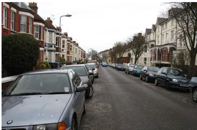
Car parking is a dominant feature in the Conservation Area (Norfolk Road)

On-street car parking is highly dominant throughout the proposed Conservation Area. It may be possible to reduce the impact of on-street car parking by the creation of carefully designed parking bays, which could incorporate planting and new street trees (which are currently only found in Norfolk Road). However, any such scheme would need to be allied to improvements in Cliftonville in general, including (possibly) the introduction of a Residents' Parking Scheme.