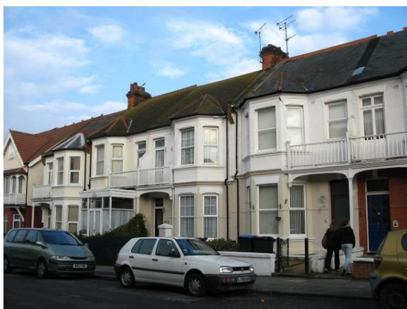
Surrey Road east side

None of the buildings in the Conservation pre-date 1879, when the area was still fields. Nearly all of the buildings in Norfolk Road and Warwick Road were built as family houses or small hotels or guest houses between 1899 and 1907, apart from Nos. 35-49, which are the only buildings in the present Conservation Area which are shown on the 1899 map. The properties in Surrey Road are more mixed – Nos. 2-26 are shown on 1907 map, Nos. 31-47 appear to have been built soon after, possibly around 1910, and the remainder are post-World War I, probably 1920s. The houses are largely arranged in uniform terraces, either two or three storeys high. The hotels and guest houses do not stand out as many were once private residences which have simply been converted or amalgamated with neighbouring properties to make larger units.