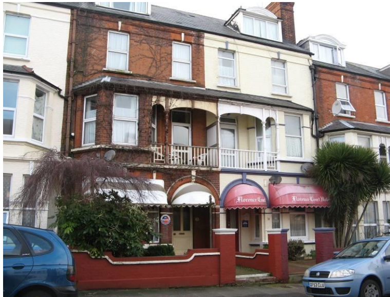
The Florence Court Hotel, Surrey Road

A number of small hotels and guest houses can also be found in the Conservation Area, such as the Florence Court Hotel (No. 18 Surrey Road) and there is what appears to be a further hotel immediately next door (No. 20). On the western side of the same road, the former Embassy Hotel (No. 50) has reverted to dwellings, and again in Surrey Road, the former Leslie Hotel (Nos. 1 and 3) has been demolished and replaced with a smaller scale residential development.