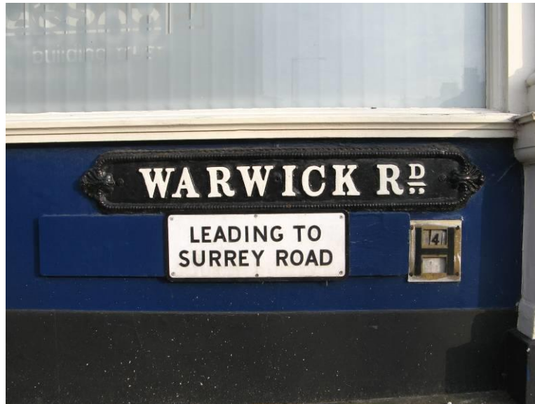
Original cast iron 'Cliftonville' nameplate for Warwick Road

There is little original floorscape in the Conservation Area apart from some setted or stone slab gutters and narrow (150 mm) granite kerbing. These can be seen in many locations in the Conservation Area. The pavements are generally covered in black tarmac or concrete slabs. Street lighting is provided by simple hockey-stick steel standards. Street nameplates are usually modern, with black lettering on white signs supported on black posts. Warwick Road retains an example of one of the 'Cliftonville' type nameplates made of cast iron, which can be seen at the south end of the road close to the junction with Northdown Road.