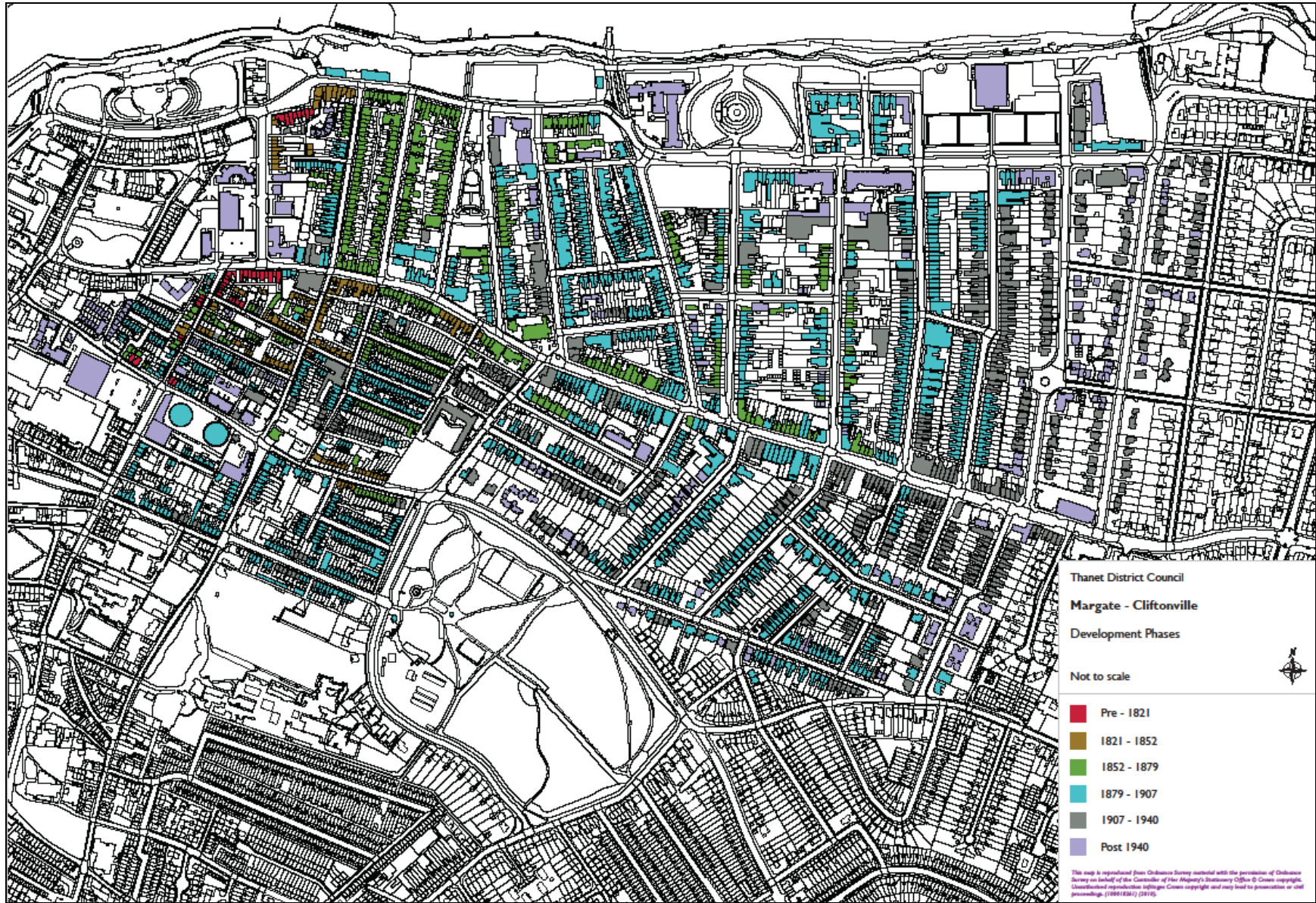
Appendix 1 Map 1 Development Phases