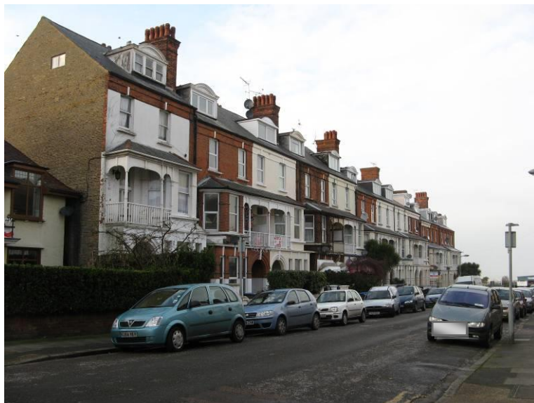
Nos. 2-24 Surrey Road

The buildings of Surrey Road are generally not so well detailed or well preserved as the other two streets, and also later in date. Nos. 2-24 are shown on the 1907 map but otherwise the remaining properties probably date from the 1920s (allowing for a gap of about ten years during World War I). Architecturally, Nos. 2-24 are the most interesting – they are substantial three storey high buildings which may have been built as guest houses as they were closer to the beach. They have first floor balconies which would have provided views down to the promenades and are built from red brick with first floor balconies. The windows were mainly sashed but very few original examples remain today. The roofs face the front and have three light dormers with rounded pediments – clearly original. Further north, but on the same side of the road, Nos. 30-46 date to the 1920s and have been much altered.