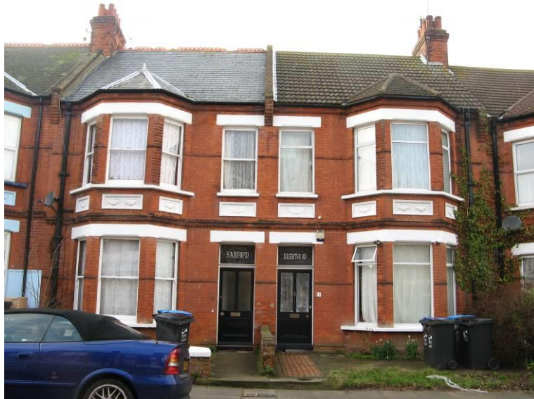
Houses like these in Warwick Road would be protected from unsympathetic alterations by an Article 4 Direction

The District Council is required to both ‘preserve and enhance’ the character of the Conservation Area. Some inappropriate alterations are visible throughout the conservation area. At the moment, however, the changes that have been made are in fairly localised locations and that on the whole the area has been fairly maintained. Whilst alterations have so far been relatively localised there is also evidence of more and more inappropriate alterations and additions within the area. In order to restrict the rights of landowners from carrying out inappropriate development an Article 4 Direction can be placed on specific buildings or areas. This enables the local planning authority to require permission for what is otherwise allowed without consent. This does not mean that permission would be refused but allows the authority to assess any potential impact to the buildings, the street scene and the conservation area.