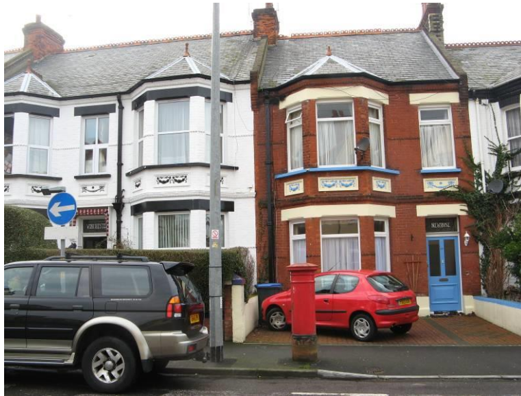
The front garden to this property in Norfolk Road has been converted into a car parking space

The closely packed nature of the buildings within the proposed Conservation Area means that there are few, if any, sites where new development might be possible although the replacement (in time) of the poorer quality 20 th century buildings would be welcome. There are no vacant sites so it is likely that new development will be limited to extensions to existing buildings or the replacement of these modern buildings. In a number of locations, flank walls, flat roofed garages, and poorly maintained back access alleys make a particularly negative contribution to the street scene.